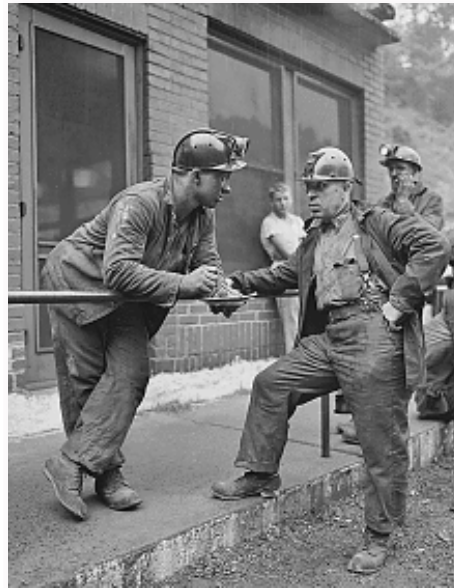
Miners ready for work, Gary Mines, McDowell County, NA

This Strategic Management Action Plan, based on these partners' cooperation and commitment to implementation, provides the foundation for future success within the National Coal Heritage Area.