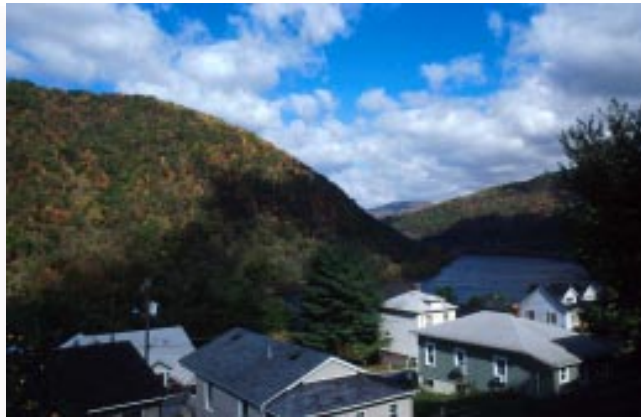
Hinton, Summers County.

A four-phase, 10-year implementation plan is recommended. Action items within each phase bridge plan elements that pursue multiple management objectives. Early actions focus on stabilizing the management structure, strengthening partnerships, and developing first phase visitor destinations. Subsequent phases pursue similar objectives in locations throughout the National Coal Heritage Area.