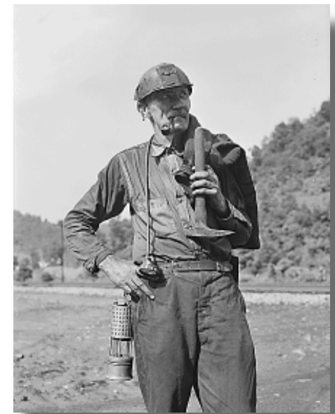
Coal miner, Mullens Smokeless Coal Company, Wyoming County.

The story of coal heritage continues to be told first hand through the memories and stories of the people who lived and worked in the distinctive communities of the region. Five primary themes form the fabric of the coal heritage experience: the coal business, working in coal, the company town, mining technology, and crisis and renewal. Woven within the fabric are the stories of people bound to an industry through geography, culture and economic dependence. Connecting visitors with the authentic sites and experiences of mining will bring an understanding of coal mining’s impact on the region and nation. Stories told by and through the region’s populace will challenge perceptions and stereotypes of Appalachia and coal camp life. Thematically -linked destinations will provide an organized framework for